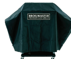
DPA110 Grill Cover