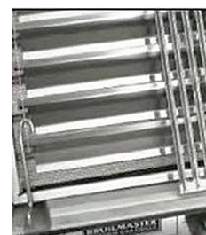
DPA100 Smoker Shutter