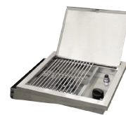
DPA153 with DPA150