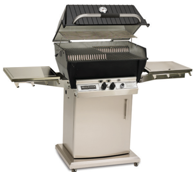
P3SX Gas Grill