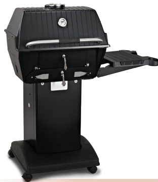
Independence Charcoal Grill