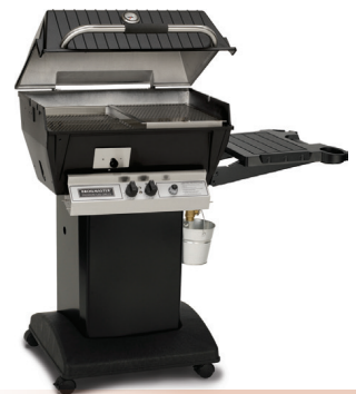
Grave Gas Slow Cooker / Smoker