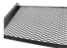
DPA118 SS Diamond Pattern Veggie/Seafood Two Level Cooking Grids