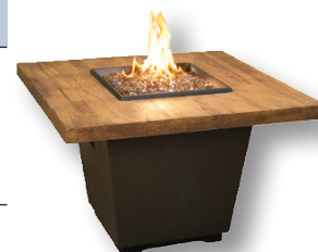
French Barrel Oak Cosmo Square Fire Table