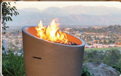
FIRE URNS AND LANTERNS