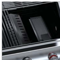
Infrared Searing Burner