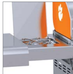
Concealed Side Burner