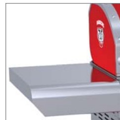
Stainless Steel Side Shelves