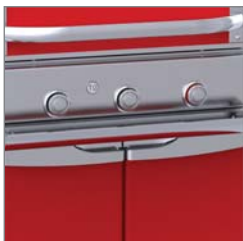
Stainless Steel Concealed Control Panel & Front Shelf