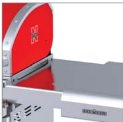
Extendable, Stainless Steel Side Shelves