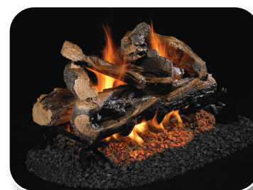
RRSO-2 Rugged Split Oak See-Thru Log Set