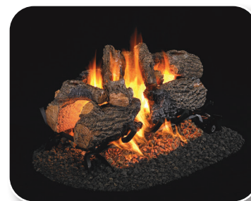
CHD-2 Charred Oak See-Thru Log Set