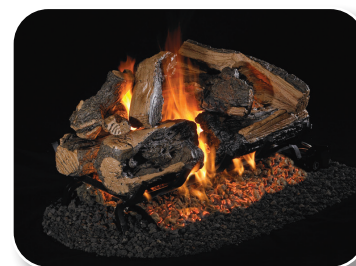
CHRRSO-2 Charred Rugged Split Oak See-Thru Log Set