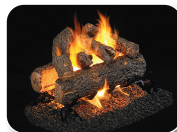
RDP-2 Golden Oak See Thru Log Set