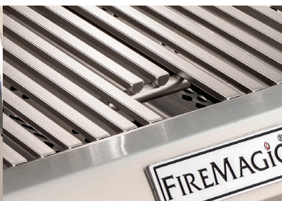
DIAMOND SEAR COOKING GRIDS*