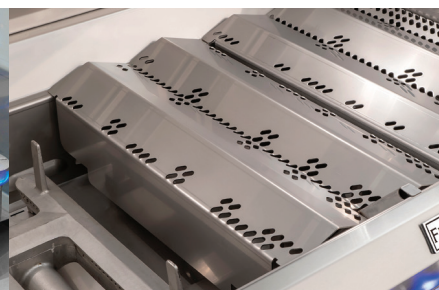
ZONE FLAVOR GRIDS