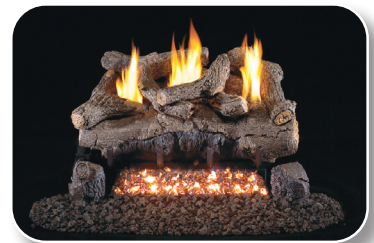
EFV Evening Fyre