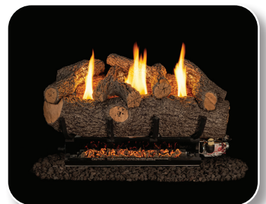
M9 - Meadow Oak