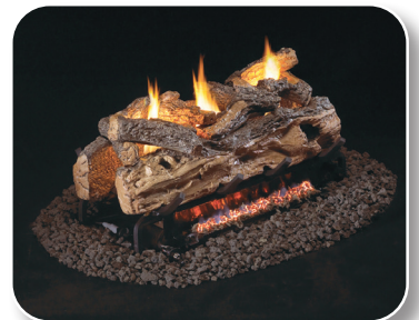
S9 - Split Oak