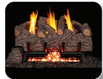
GNO Gnarled Oak

SOME BRANDS ARE ONLY AVAILABLE IN SELECTED AREAS, SEE MAP ON PAGE 4 OR CONTACT YOUR REGIONAL SALES MANAGER FOR MORE INFO.