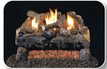
ECV Evening Fyre Charred