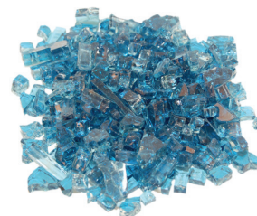
Caribbean Blue Glass