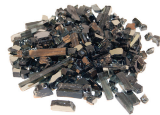
Black Reflective Glass