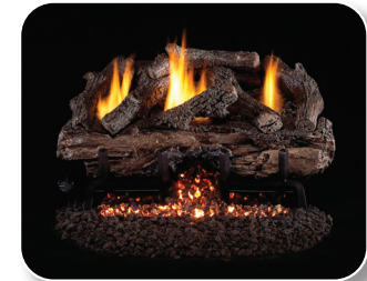
CHAS Charred Aged Split