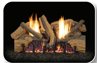
Foothill Split Oak