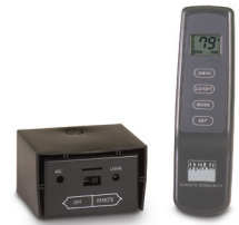
VR - 1A