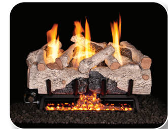
CHAB Charred Alpine Birch