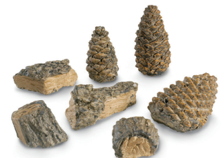
DP - 2