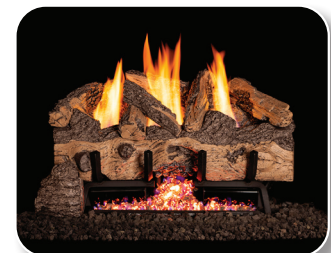
CHGS Charred Gnarled Split