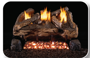
ESV Evening Fyre Split