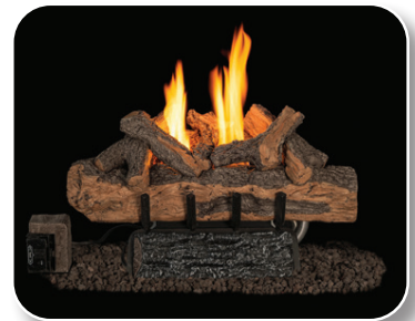
SV08 - Split Valley Oak