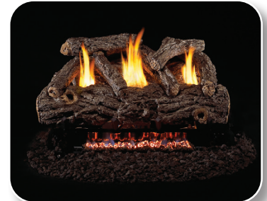
RD9 - Golden Oak