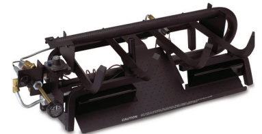
G10 - Burner