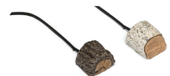
Bluetooth Control with Cover

SOME BRANDS ARE ONLY AVAILABLE IN SELECTED AREAS, SEE MAP ON PAGE 4 OR CONTACT YOUR REGIONAL SALES MANAGER FOR MORE INFO.