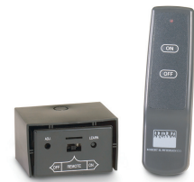
RR - 1A