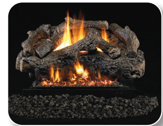
CHFR Charred Frontier Oak