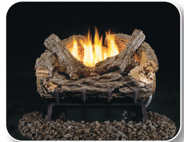
VO8 - Valley Oak