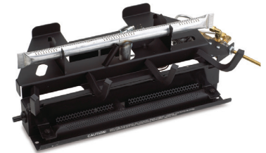
G9 - Burner