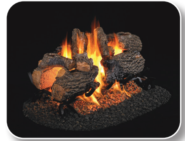
CHD-2 Charred Oak