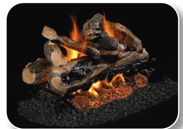
RRSO-2 Rugged Split Oak