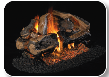
CHRRSO-2 Charred Rugged Split Oak