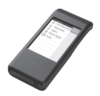
RC400 Remote (Included)