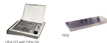
DPA153 with DPA150