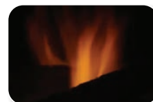
Reflective Glass Liner

SOME BRANDS ARE ONLY AVAILABLE IN SELECTED AREAS, SEE MAP ON PAGE 4 OR CONTACT YOUR REGIONAL SALES MANAGER FOR MORE INFO.