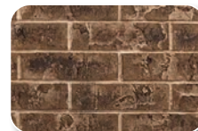
Traditional Tavern Brown Liner