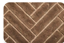
Tavern Brown Herringbone Panels