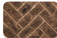
Herringbone Tavern Brown Liner