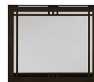
Contemporary Rectangle Front

SOME BRANDS ARE ONLY AVAILABLE IN SELECTED AREAS, SEE MAP ON PAGE 4 OR CONTACT YOUR REGIONAL SALES MANAGER FOR MORE INFO.