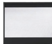
Decorative Black Mesh Front