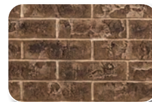
Tavern Brown Traditional Panels