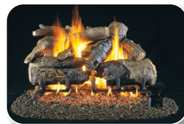
CHAO Charred American Oak