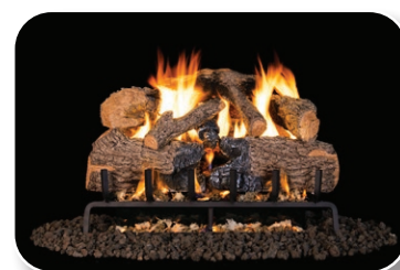
CHNA Charred Angel Oak