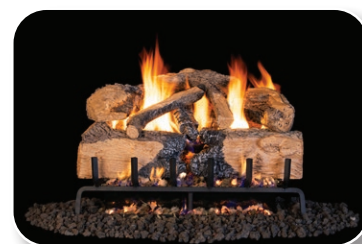
CHNS Charred Angel Oak Split

SOME BRANDS ARE ONLY AVAILABLE IN SELECTED AREAS, SEE MAP ON PAGE 4 OR CONTACT YOUR REGIONAL SALES MANAGER FOR MORE INFO.