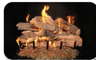
SDP Split Oak Designer Plus