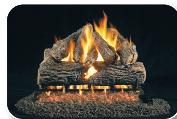
CHD Charred Oak