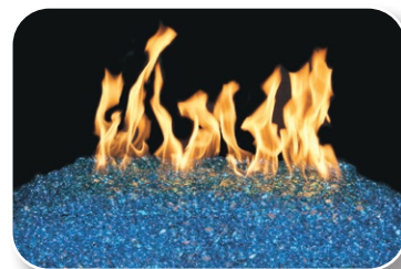
Blue Topaz Gems