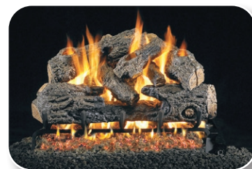
CHN Charred Northern