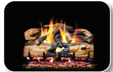
ENS Charred Evergreen Split Oak