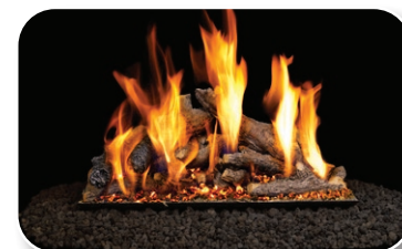
SDW Shoreline Driftwood

SOME BRANDS ARE ONLY AVAILABLE IN SELECTED AREAS, SEE MAP ON PAGE 4 OR CONTACT YOUR REGIONAL SALES MANAGER FOR MORE INFO.