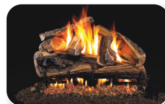
RRSO - Rugged Split Oak