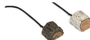
Bluetooth Control with Cover

SOME BRANDS ARE ONLY AVAILABLE IN SELECTED AREAS, SEE MAP ON PAGE 4 OR CONTACT YOUR REGIONAL SALES MANAGER FOR MORE INFO.