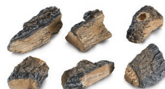
WCH-6 - Wood Chips