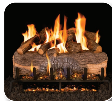
MCO Mountain Crest Oak

NOTE: CHARRED OAK (CHD), CHARRED SPLIT (CHS), CHARRED AMERICAN OAK (CHAO), CHARRED ROYAL ENGLISH OAK (CHB), CHARRED ANGEL OAK (CHNA) AND CHARRED ANGEL SPLIT OAK (CHNS) ARE ALSO COMPATIBLE W/ G31 BURNER SYSTEM.