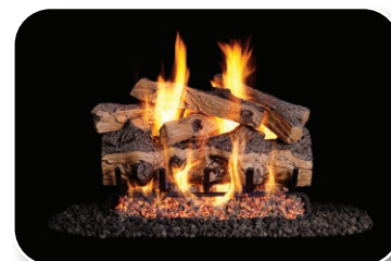
GSO Gnarled Split Oak