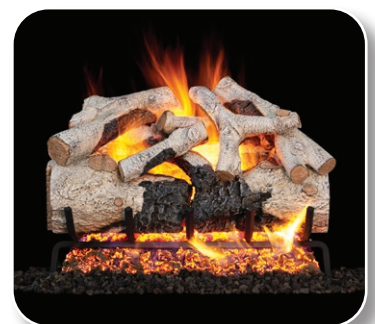
BTA Burnt Aspen

SOME BRANDS ARE ONLY AVAILABLE IN SELECTED AREAS, SEE MAP ON PAGE 4 OR CONTACT YOUR REGIONAL SALES MANAGER FOR MORE INFO.