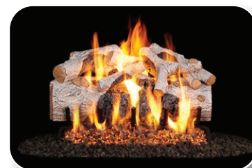
CHMBW Charred Mountain Birch