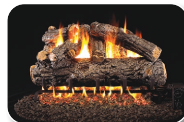
HRD Rustic Oak Designer