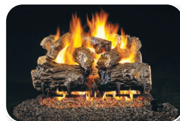
HCHR Burnt Rustic Oak