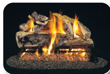
CHRRSO Charred Rugged Split Oak

SOME BRANDS ARE ONLY AVAILABLE IN SELECTED AREAS, SEE MAP ON PAGE 4 OR CONTACT YOUR REGIONAL SALES MANAGER FOR MORE INFO.