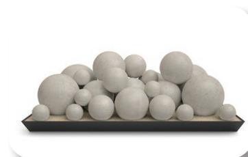
FSM-24-GS Graystone Mixed Fyre Spheres

SOME BRANDS ARE ONLY AVAILABLE IN SELECTED AREAS, SEE MAP ON PAGE 4 OR CONTACT YOUR REGIONAL SALES MANAGER FOR MORE INFO.