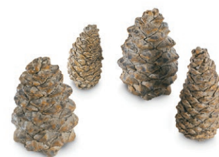
PC-4 - Pine Cones