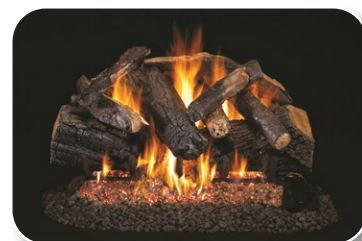
CHMJ Charred Majestic Oak

* Recommended to Use GX4 or GX45 Burner Kit with Heavy Duty Grate