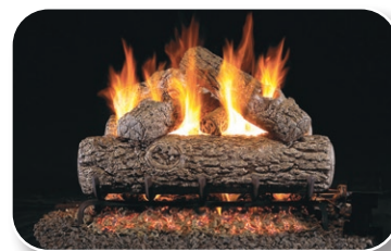
R - Golden Oak

* Recommended to Use GX4 or GX45 Burner Kit with Heavy Duty Grate