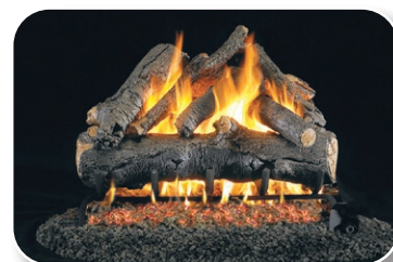
AO American Oak