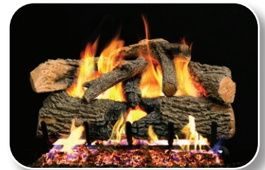
ENO Charred Evergreen Oak