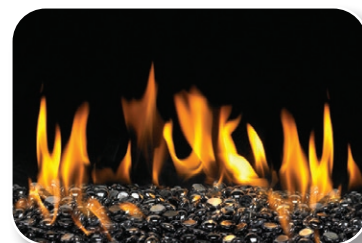
Black Pearl Gems