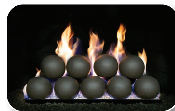
FS5-xx-EB Epic Black Fyre Spheres