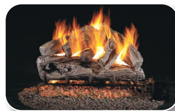
CDR - Coastal Driftwood

SOME BRANDS ARE ONLY AVAILABLE IN SELECTED AREAS, SEE MAP ON PAGE 4 OR CONTACT YOUR REGIONAL SALES MANAGER FOR MORE INFO.