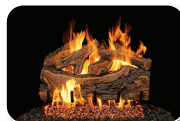
RFS Rugged Forest Split