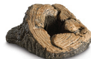
WCRD-1 Wood Chip Ring