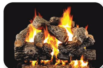
CHB Charred Royal English Oak

SOME BRANDS ARE ONLY AVAILABLE IN SELECTED AREAS, SEE MAP ON PAGE 4 OR CONTACT YOUR REGIONAL SALES MANAGER FOR MORE INFO.