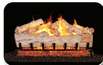
MBW - Mountain Birch

* Recommended to Use GX4 or GX45 Burner Kit with Heavy Duty Grate