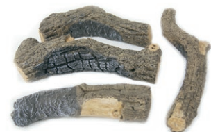
BDC-4 Charred Branches