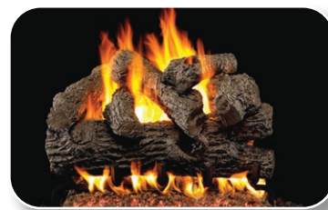
B - Royal English Oak