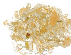
Gold Reflective Glass