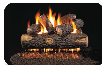
WO - Woodland Oak

SOME BRANDS ARE ONLY AVAILABLE IN SELECTED AREAS, SEE MAP ON PAGE 4 OR CONTACT YOUR REGIONAL SALES MANAGER FOR MORE INFO.