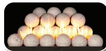
FS4-24-CM Carrera Marble Fyre Spheres