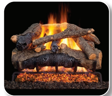
CLO Colonial Oak