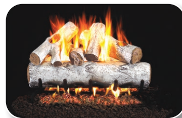
W - White Birch