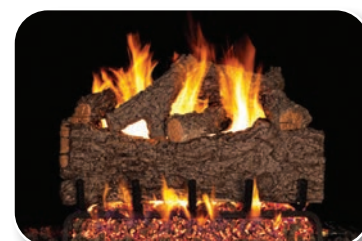
CN Chestnut Oak

*Recommended to use GX4 or GX45 Burner Kit with Heavy Duty Grate