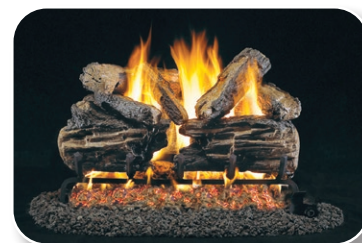
CHS Charred Split

* Recommended to Use GX4 or GX45 Burner Kit with Heavy Duty Grate