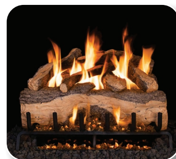
MCS Mountain Crest Split Oak