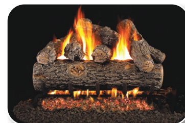
RDP Golden Oak Designer Plus