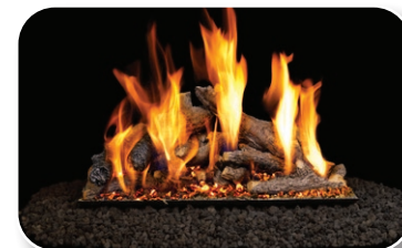
SO Shoreline Designer Oak