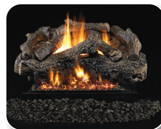
CHFR Charred Frontier Oak