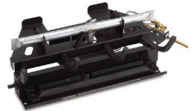
G9 - Burner