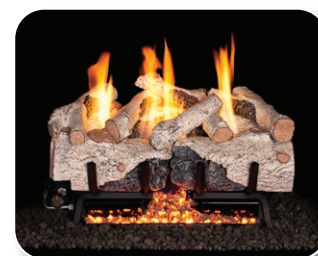
CHAB Charred Alpine Birch