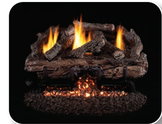
CHAS Charred Aged Split