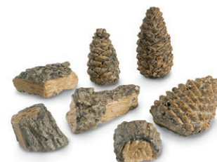
DP - 2