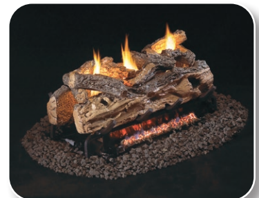
S9 - Split Oak