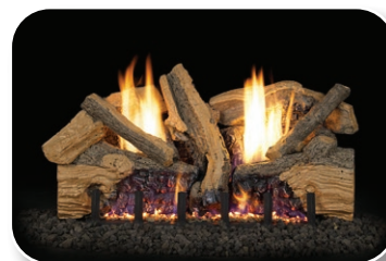
Foothill Split Oak