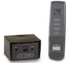
VR - 1A