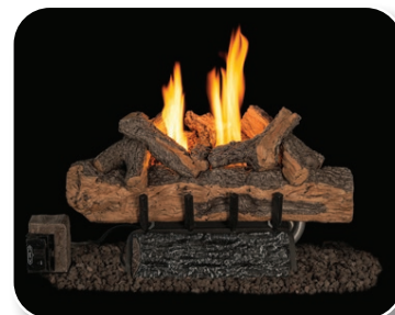
SV08 - Split Valley Oak