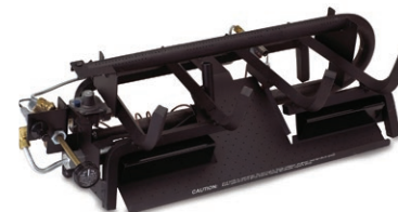
G10 - Burner