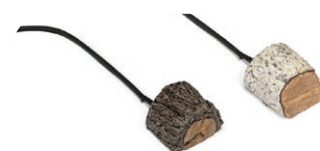
Bluetooth Control with Cover