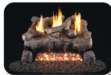
EFV Evening Fyre