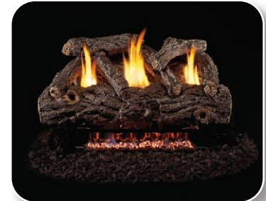
RD9 - Golden Oak