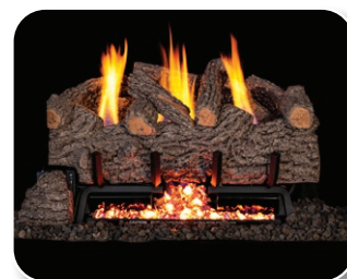
GNO Gnarled Oak

SOME BRANDS ARE ONLY AVAILABLE IN SELECTED AREAS, SEE MAP ON PAGE 4 OR CONTACT YOUR REGIONAL SALES MANAGER FOR MORE INFO.