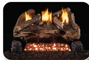
ESV Evening Fyre Split