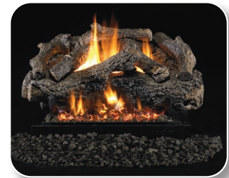
CHFR Charred Frontier Oak