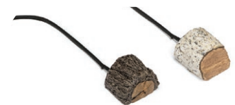
Bluetooth Control with Cover