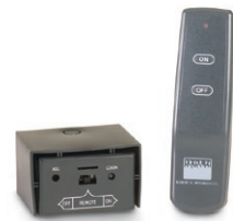
RR - 1A