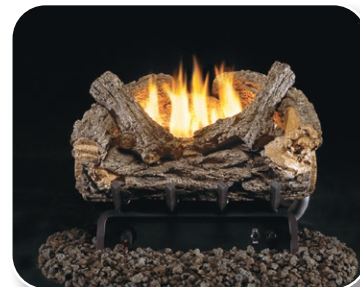
V08 - Valley Oak