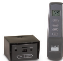
VR - 1A