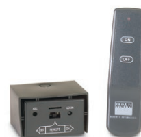
RR - 1A