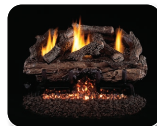
CHAS Charred Aged Split