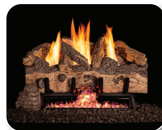
CHGS Charred Gnarled Split