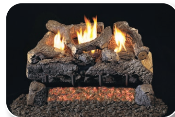
ECV Evening Fyre Charred