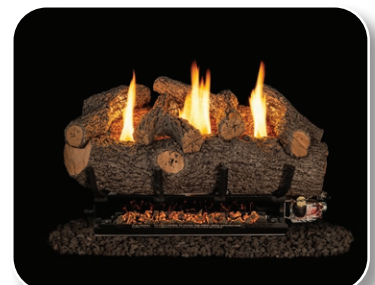
M9 - Meadow Oak