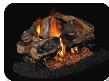
CHRRSO-2 Charred Rugged Split Oak