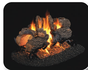
CHD-2 Charred Oak