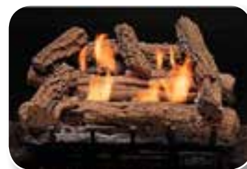
Regular Oak Logs