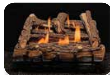
Split Oak Logs