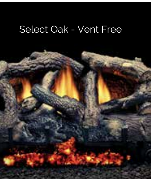
Select Oak - Vent Free