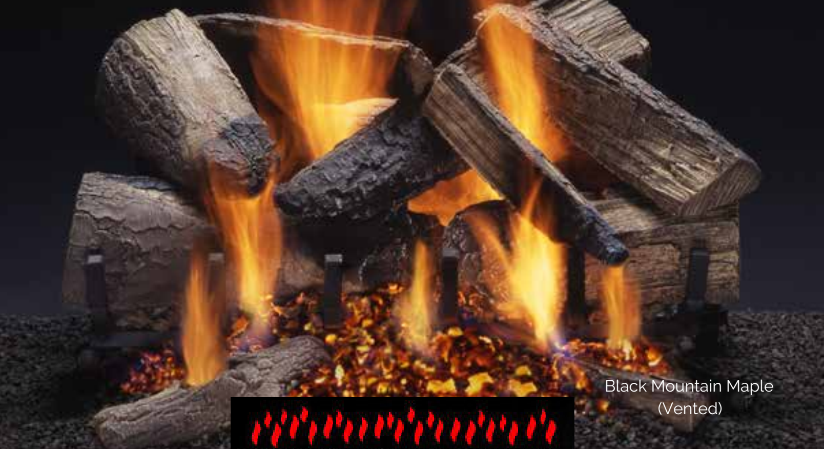
Black Mountain Maple (Vented)