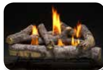
Cape Fear Oak Logs