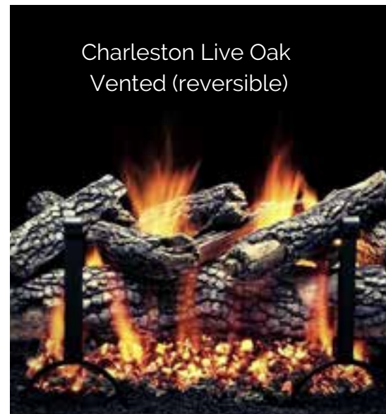
Charleston Live Oak Vented (reversible)