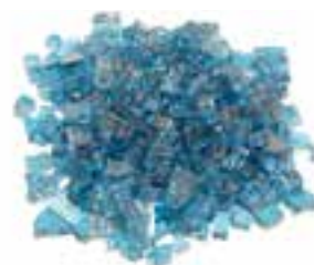
Caribbean Blue Glass