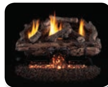
CHAS Charred Aged Split