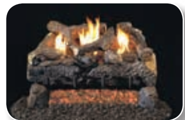
ECV Evening Fyre Charred