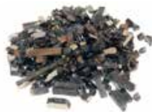
Black Reflective Glass