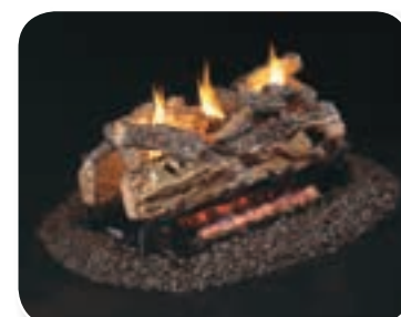
S9 - Split Oak