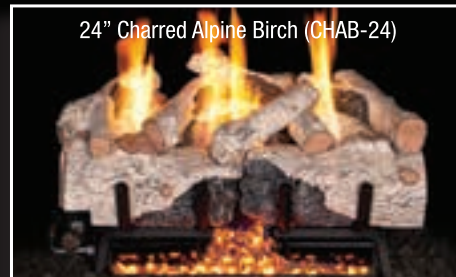
G10 BURNER SERIES