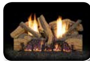
Foothill Split Oak