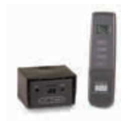
VR - 1A