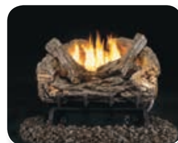
V08 - Valley Oak