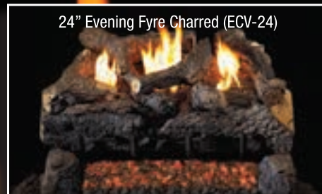
G18 BURNER SERIES