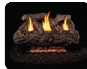
RD9 - Golden Oak