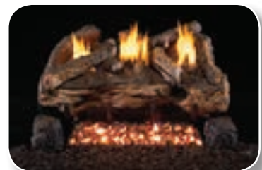
ESV Evening Fyre Split