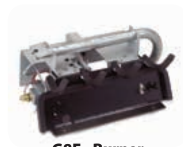
G8E - Burner