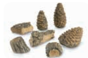
DP - 2

SOME BRANDS ARE ONLY AVAILABLE IN SELECTED AREAS, SEE MAP ON PAGE 4 OR CONTACT YOUR REGIONAL SALES MANGER FOR MORE INFO.