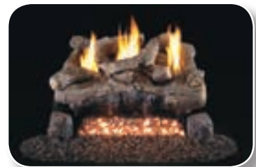
EFV Evening Fyre