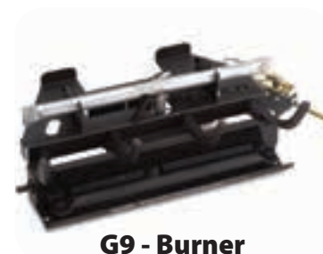
G9 - Burner

NOTE: BURNERS INCLUDE BASIC TRANSMITTER AND RECEIVER, UNLESS NOTED DIFFERENTLY.