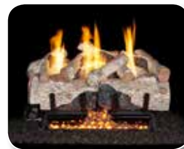
CHAB Charred Alpine Birch