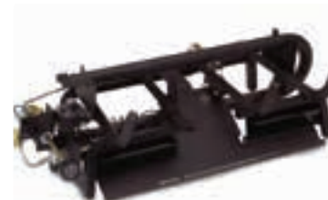
G10 - Burner

NOTE: BURNERS INCLUDE BASIC TRANSMITTER AND RECEIVER, UNLESS NOTED DIFFERENTLY.