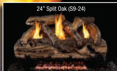
G9 BURNER SERIES