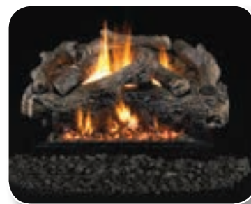
CHFR Charred Frontier Oak