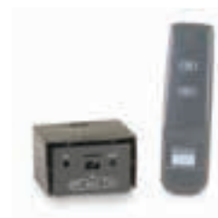
RR - 1A