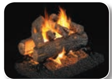
RDP-2 Golden Oak See Thru Log Set