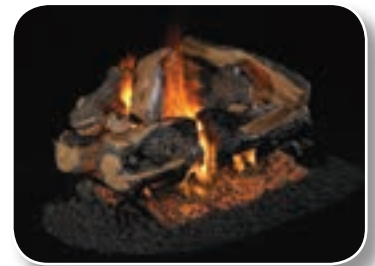
CHRRSO-2 Charred Rugged Split Oak See-Thru Log Set