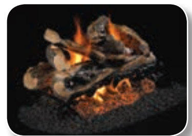
RRSO-2 Rugged Split Oak See-Thru Log Set

SOME BRANDS ARE ONLY AVAILABLE IN SELECTED AREAS, SEE MAP ON PAGE 4 OR CONTACT YOUR REGIONAL SALES MANGER FOR MORE INFO.