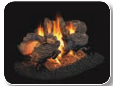
CHD-2 Charred Oak See-Thru Log Set