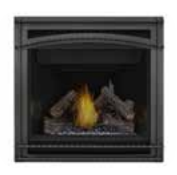
B36NTR w/X36WI Front

Fireplace Framing Dimensions Height Width Depth 35" 35 1/2" 16"