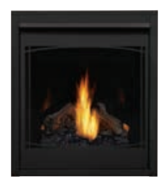
B30 w/ Z30F Zen Front