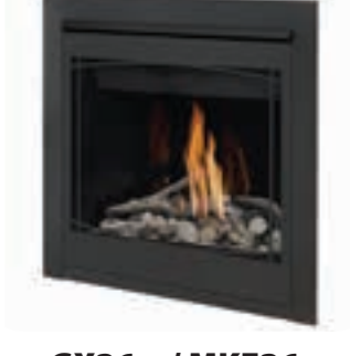
GX36 w/ MKE36, DLE, REK