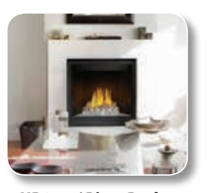
HD35 w/ River Rocks and PRPH35