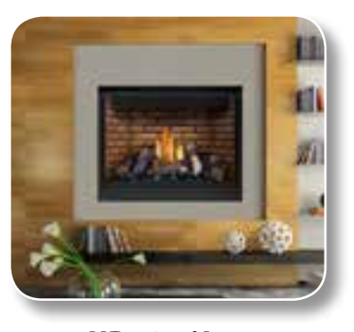
HD46 w/ Logs Standard