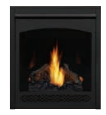
B30 w/ H30F Heritage Front