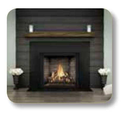
HDX52 w/ Oak Log Set

USES 8" X 11" VENTING (SEE PAGE 60) - TOP VENT ONLY. FIREPLACE FRAMING DIMENSIONS - 55 1/4" H X 57 3/8" W X 29 3/8" D.