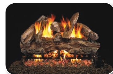
RED Red Oak