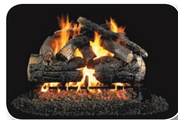
PN Pioneer Oak