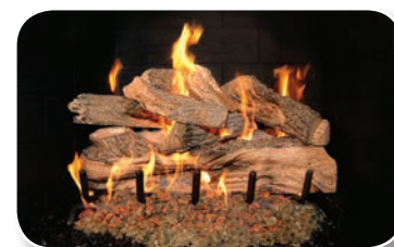
SDP Split Oak Designer Plus