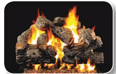
CHB Charred Royal English Oak