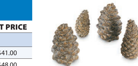
PC-4 - Pine Cones