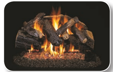
CHMJ Charred Majestic Oak

* Recommended to Use GX4 or GX45 Burner Kit with Heavy Duty Grate