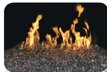
Black Granite Gems