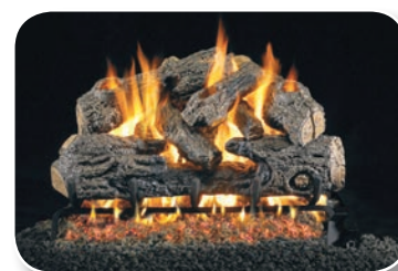
CHN Charred Northern