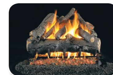
AO American Oak