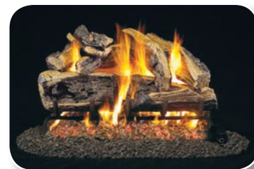
CHRRSO Charred Rugged Split Oak

SOME BRANDS ARE ONLY AVAILABLE IN SELECTED AREAS, SEE MAP ON PAGE 4 OR CONTACT YOUR REGIONAL SALES MANGER FOR MORE INFO.