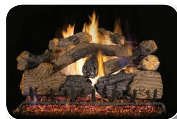
CHGO Charred Grizzly Oak