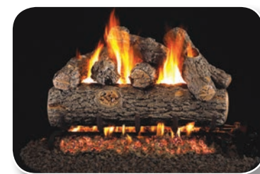
RDP Golden Oak Designer Plus