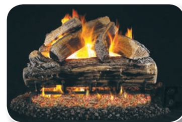
S Split Oak