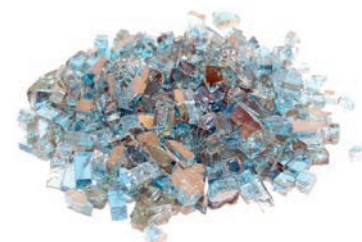
Azuria Reflective Glass