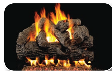
B - Royal English Oak