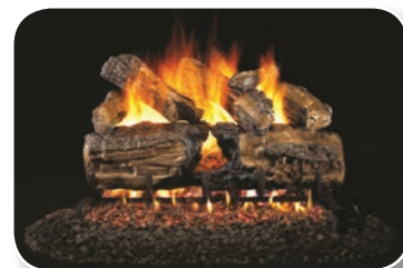
HCHS Burnt Split Oak