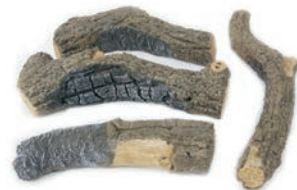
BDC-4 Charred Branches