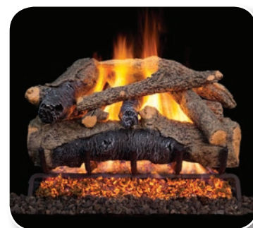
CLO Colonial Oak