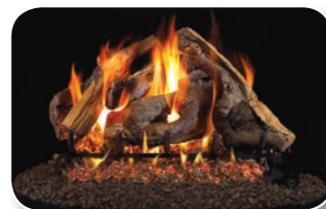
WS - Woodstock