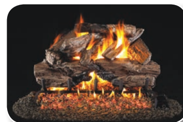
CHCR Charred Cedar