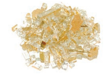
Gold Reflective Glass