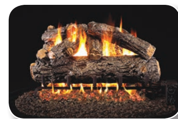
HRD Rustic Oak Designer