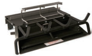
G52 Burner System