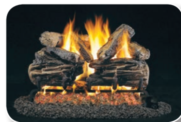
CHS Charred Split