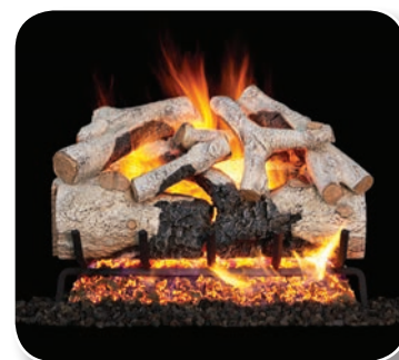
BTA Burnt Aspen

SOME BRANDS ARE ONLY AVAILABLE IN SELECTED AREAS, SEE MAP ON PAGE 4 OR CONTACT YOUR REGIONAL SALES MANGER FOR MORE INFO.