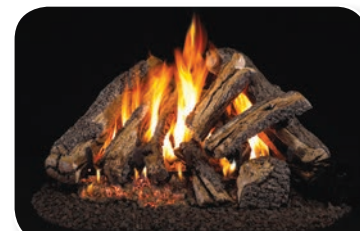
WCF Western Campfyre