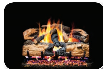
ENS Charred Evergreen Split Oak