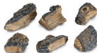
WCH-6 - Wood Chips