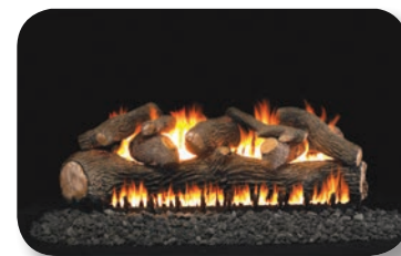
MP Mammoth Pine Logs