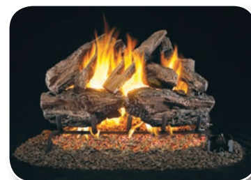
CHRED Charred Red Oak