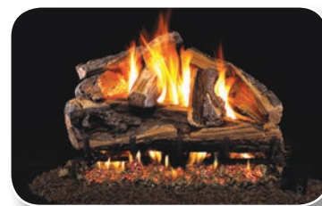
RRSO - Rugged Split Oak

* Recommended to Use GX4 or or GX45 Burner Kit with Heavy Duty Grate