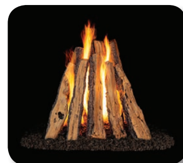
RUSO Rural Split Oak Logs

SOME BRANDS ARE ONLY AVAILABLE IN SELECTED AREAS, SEE MAP ON PAGE 4 OR CONTACT YOUR REGIONAL SALES MANGER FOR MORE INFO.