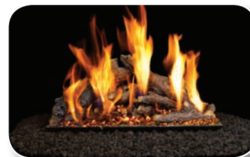
SO Shoreline Designer Oak