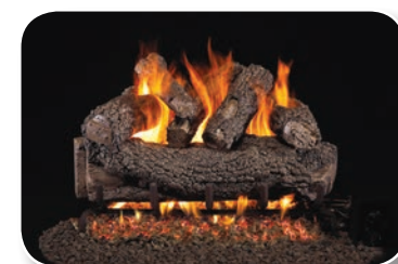
FO Forest Oak