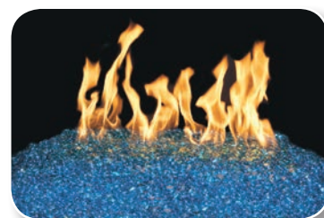
Blue Topaz Gems