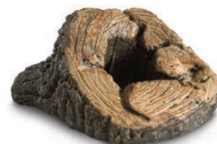
WCRD-1 Wood Chip Ring