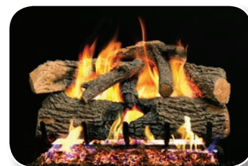
ENO Charred Evergreen Oak