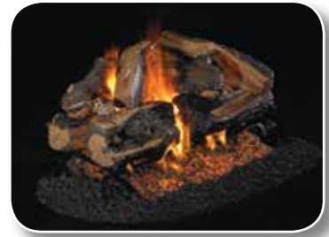
CHRRSO-2 Charred Rugged Split Oak See-Thru Log Set