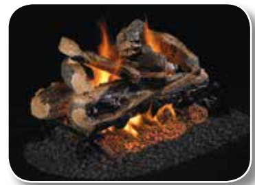
RRSO-2 Rugged Split Oak See-Thru Log Set