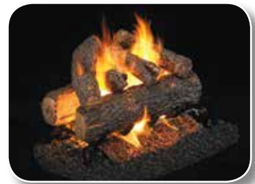
RDP-2 Golden Oak See Thru Log Set