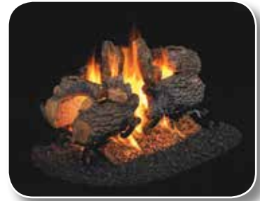
CHD-2 Charred Oak See-Thru Log Set