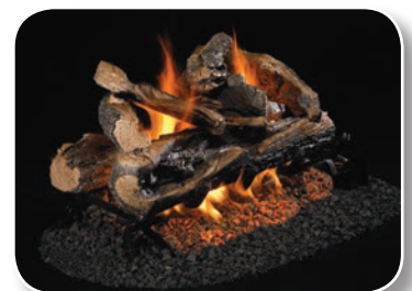
RRSO-2 Rugged Split Oak See-Thru Log Set