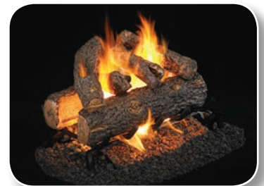
RDP-2 Golden Oak See Thru Log Set