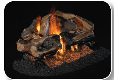
CHRRSO-2 Charred Rugged Split Oak See-Thru Log Set