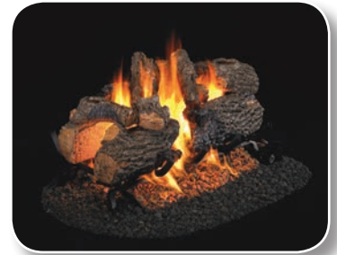
CHD-2 Charred Oak See-Thru Log Set

RMI Ph: 800-628-5044 Fax: 800-243-8341 raymurray.com 247