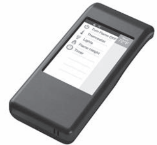
RC400 Remote (Included)

SOME BRANDS ARE ONLY AVAILABLE IN SELECTED AREAS, SEE MAP ON PAGE 4 OR CONTACT YOUR REGIONAL SALES MANAGER FOR MORE INFO.