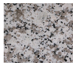
Pauline Granite Set 2