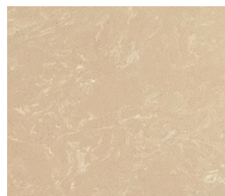
Beige Marble Set 2