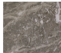
Blue Tundra set 2