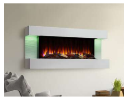
50" Floating Mantel Kit for Format