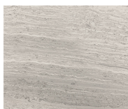
Driftwood set 2